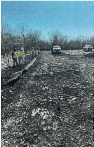
Figure 4: Silt fence installation.