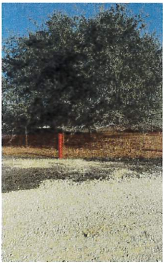
Figure 3: Tree protection.