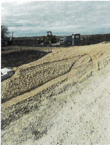
Figure 1: Installed 18" RCP, SET's and flex base.