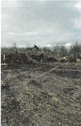
Figure 2: Clearing and grubbing.